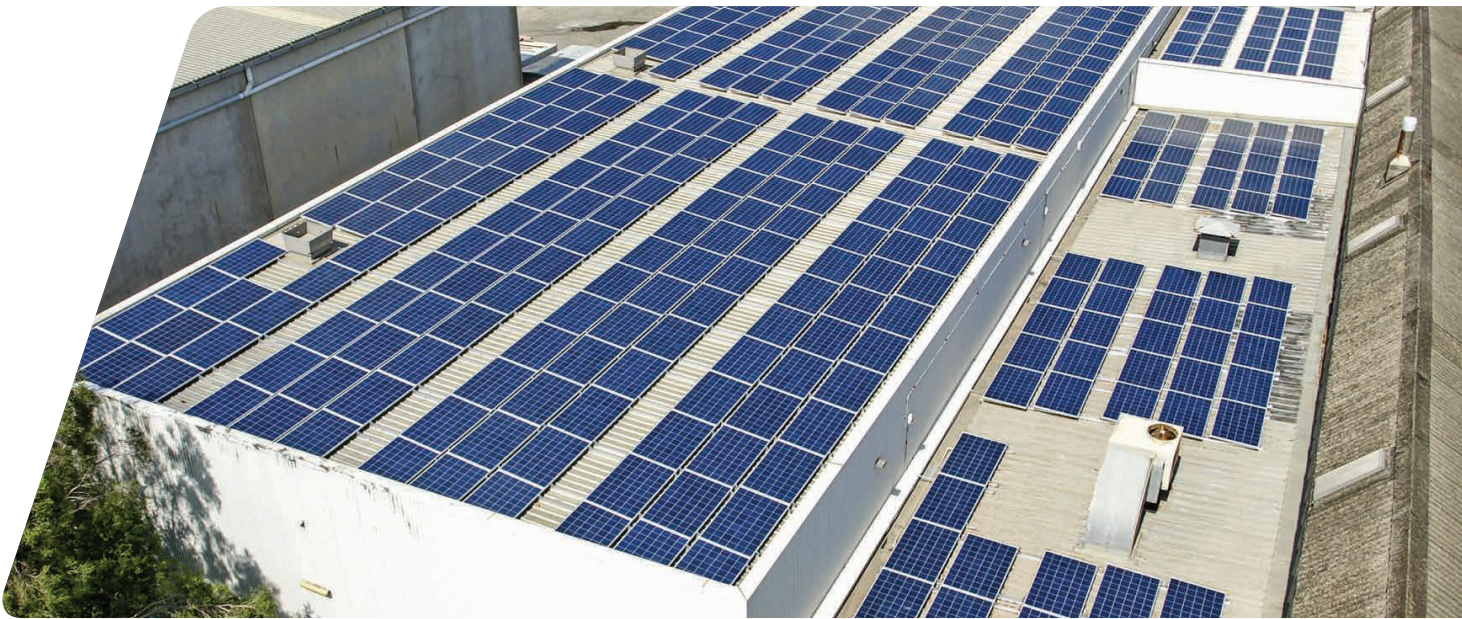
Lorna Jane's 100 kW system optimized by SolarEdge power optimizers and SolarEdge inverters for increased energy, maximum design flexibility, and enhanced maintenance.

“SolarEdge power optimizers and inverters help PV system owners achieve higher self-consumption.”